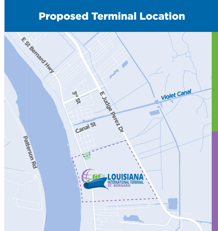
Source: Lewis Terrell and Associates, Louisiana International Container Growth: The Economic Impact of the Louisiana International Terminal. April 2021 All figures represented in 2020 dollars.